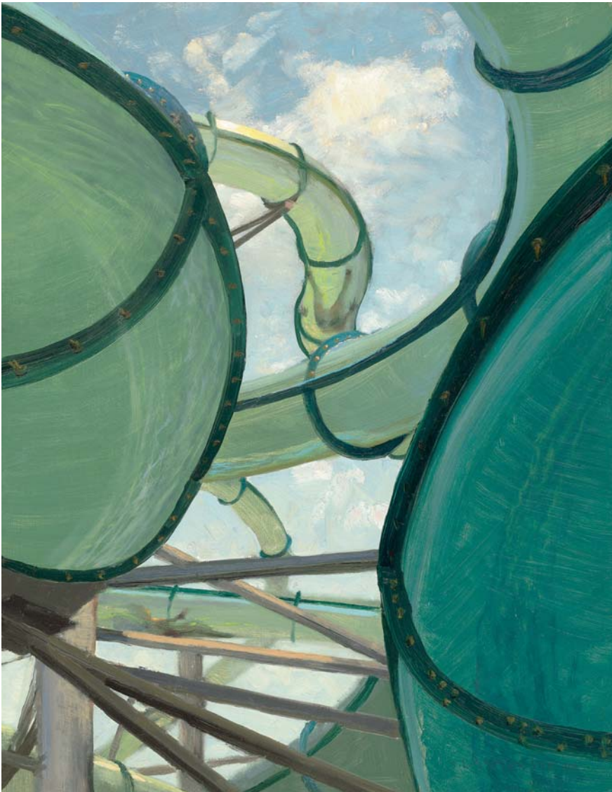
Waterslide, oil on canvas, 18 x 14"