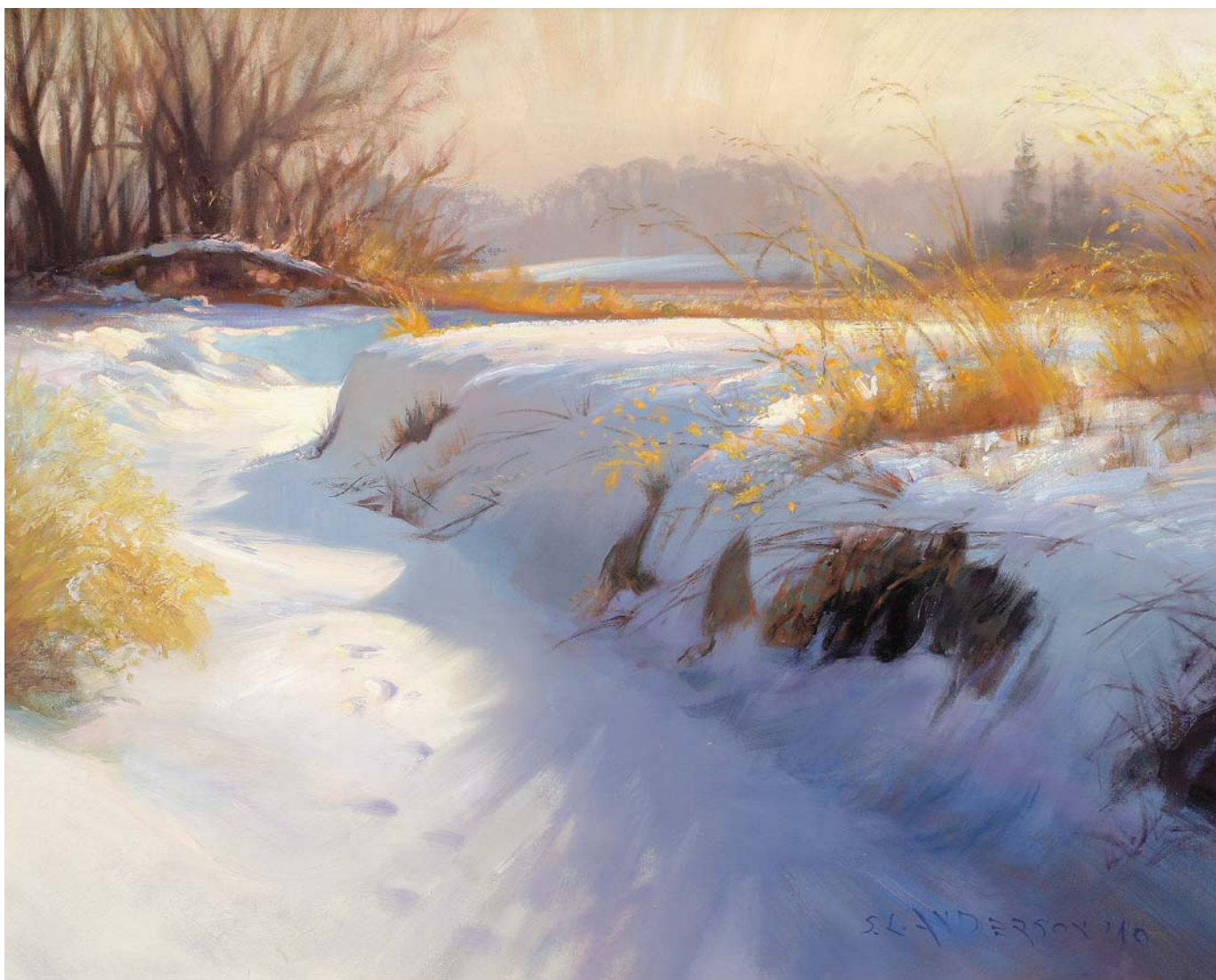
Winter Sun and Shadow , oil on canvas, 24 x 30"