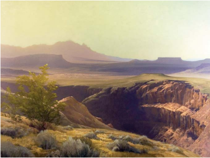
Morning Over Virgin, Utah, oil on canvas, 36 x 48"